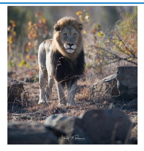
Africa. Having vacationed in South Africa many times I can

The Trustees are looking forward to seeing many of you at the BISMiS-2018 meeting in South