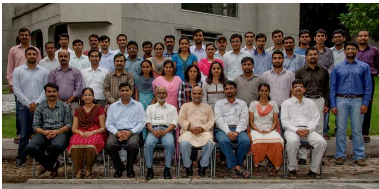
The Team at the Microbial Culture Collection, Pune, India

cultures to industrial partners selected for various bioactivity screening programs. Recently, MCC has begun to accept other deposits, and it currently holds 43 cultures (26 bacteria and 17 fungi) under general deposit and five cultures as an IDA. The MCC is already offering rRNA gene sequence based microbial identification services to academic and industrial clients. In the last year, ~2000 samples of bacteria and fungi have been identified. Very soon, MCC expects to offer additional identification services, such as phenotypic characterization, FAME analysis, G+C mol%, and DNA-DNA hybridization. MCC is also working toward obtaining ISO certification for its service activities so as to achieve highest quality standards.